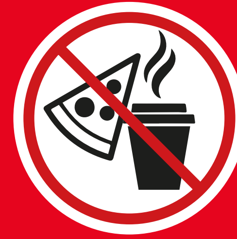
HOT FOOD AND DRINKS