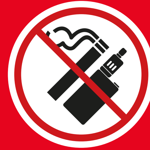
SMOKING INCLUDING E-CIGARETTES