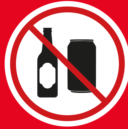
GLASS AND CANS

Supporters are not permitted to bring any of the following items into the stadium and these items may be confiscated on entry or if seen and these may not be returned: