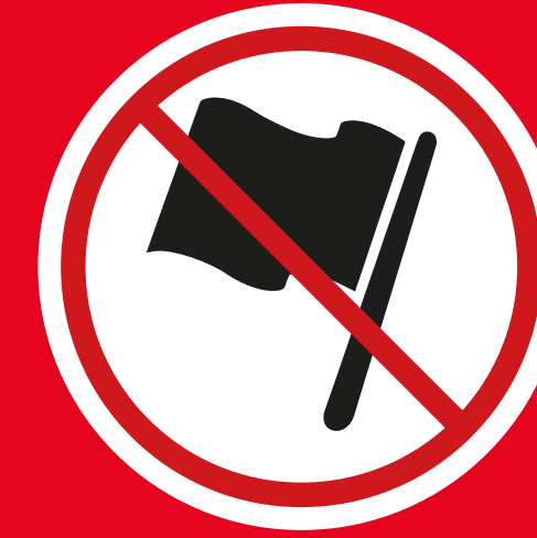
FLAGS AND BANNERS UNLESS AUTHORISED