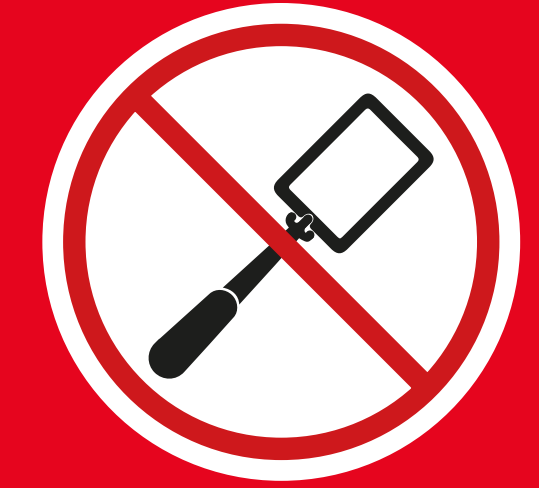
POLES INCLUDING SELFIE STICKS